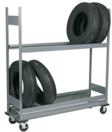
Mobile Tire Rack 18"D x 60"W x 67"H 2 tier with casters / Part No. 806-52MOB