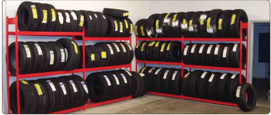
Tire racks are adjustable for all passenger car sizes of tires and rims. If you require shelving to fit truck tires please contact Equipto.