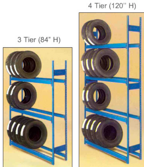
806-52S Starter 806-52A Add-on 806-32S Starter 806-32A Add-on